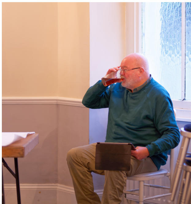
Stew completes a vital stage of the Cambridge admissions process.

Toby had not realised, or at least were unable to maintain the commitment, that once you have started there should be no escape. Fortunately, more by luck than judgement, we were able to play a draw that coped. We started out with a 9 players explosion with three games of three in each round, and on the first day we had played exactly half of that (six rounds) which we assumed would be a reasonably fair selection of games. So, on the second day we played an 7-player all-partner all (or 8 players with an R. T. Fishall, if you prefer) for a further seven rounds of winks.