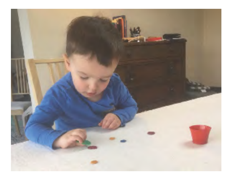
What a cruel world we live in that children of such a young age are forced to endure the horrors of squopping one's own wink.