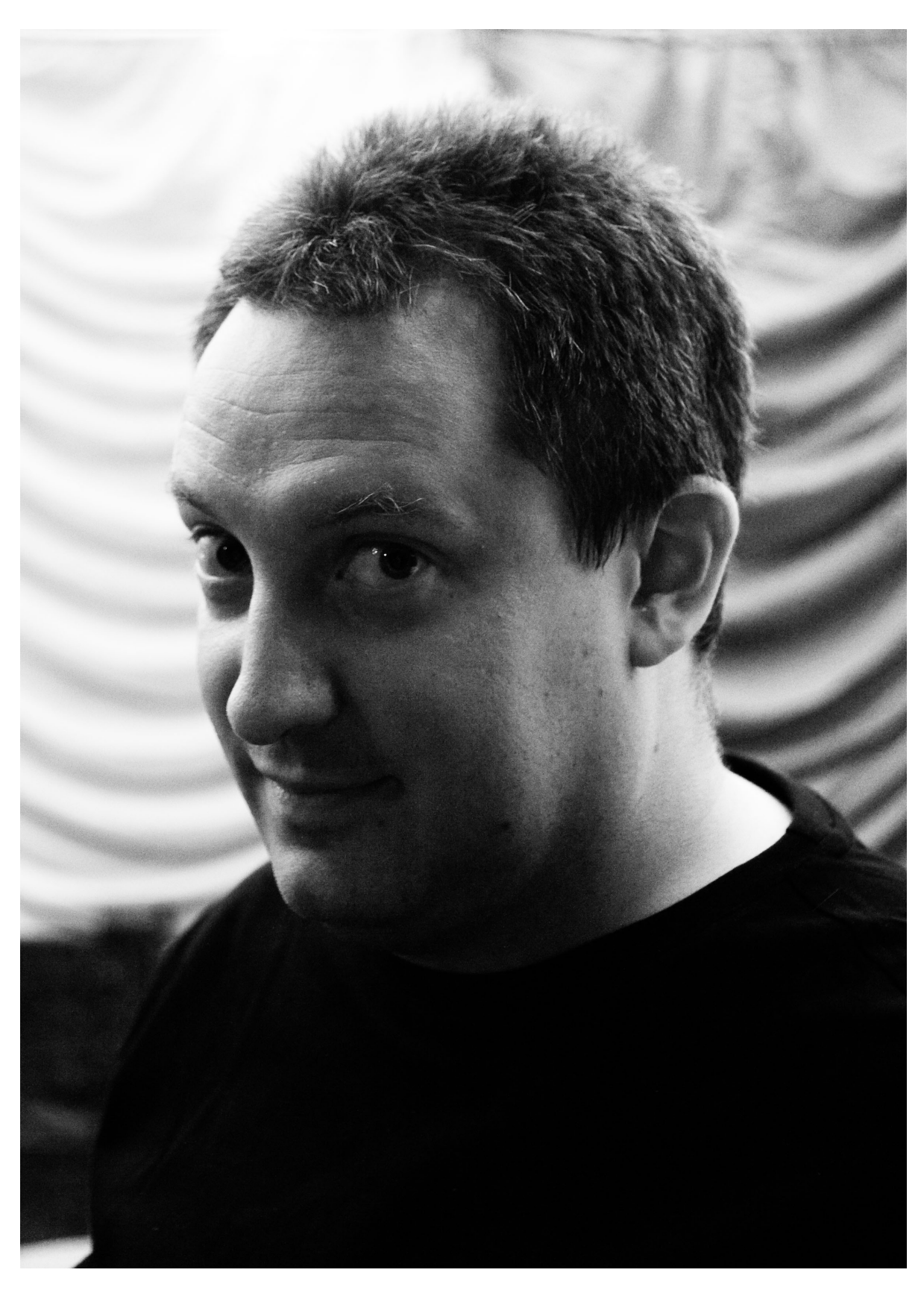
An Article on Etiquette? Next thing you'll be telling us you're a Master of Politeness.